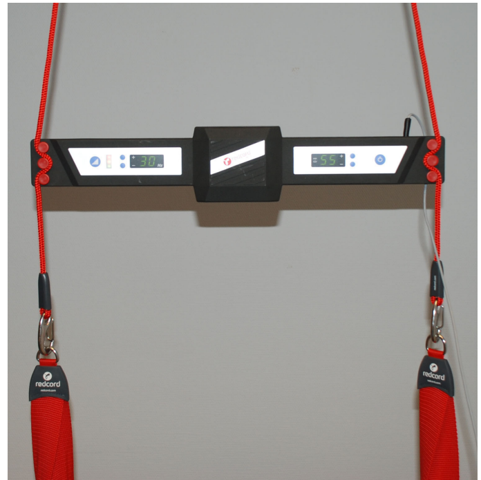
Figure 1: The vibration apparatus Redcord Stimula

The registration was carried out to provide a basis for further development of the treatment method and the device. The final version of the