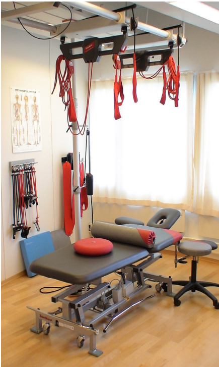
Figure 2: Redcord Workstation with sliding suspension, slings, and treatment table.