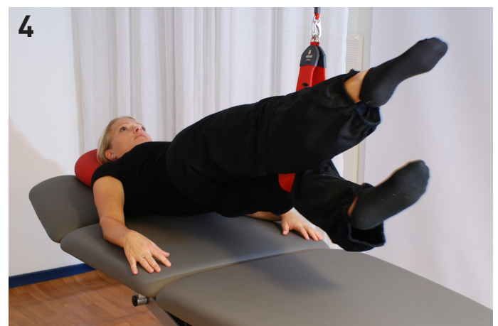
Figure 5: Example of a Weak Link test: Supine Pelvic Lift with increasing difficulty. Picture 1 and 2 show how the sling attached with elastic cords under the pelvis unloads bodyweight. The unloading can be gradually reduced to make the exercise more challenging. In picture 3 and 4 the elastic cords have been removed.